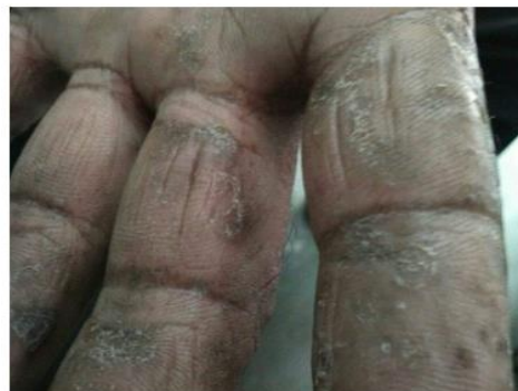
Figure 1.2 Psoriasis on Palms

Psoriasis Vulgaris (which is also known as chronic stationary psoriasis or plaque-like psoriasis) is the most common form and affects 85%–90% of people with psoriasis. Plaque psoriasis is typically appeared as raised areas of inflamed skin covered with silvery white scaly skin. These areas are called plaques and are most commonly found on the elbows, knees, scalp, and back.