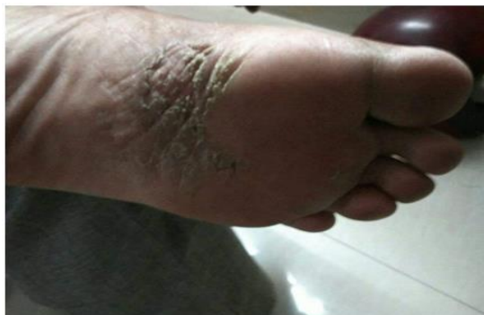
Figure 1.1 Psoriasis on sole of foot

Salicylic acid and coal tar also used in the management of psoriasis and few Natural ingredients for smooth itch like Aloe vera gel etc. Topical emollients that put on after a shower or bath can help keep the skin moist.